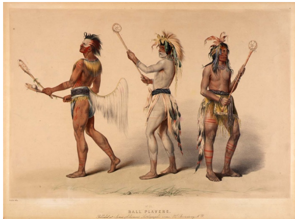
Figure 1. Ball Players. George Catlin. Date unknown.

American Indians are thought to have founded the modern game of lacrosse, as well as other stick games. Lacrosse, which received its name from French settlers, was more than a form of recreation. It was a cultural event used to settle disputes between tribes.