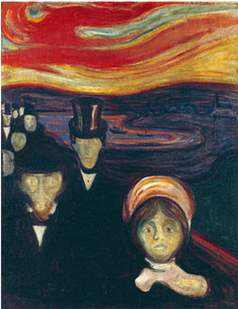
Anxiety. By Edvard Munch. 1894.

This chapter will provide a deeper understanding of what stress is and provide effective strategies for managing stress.