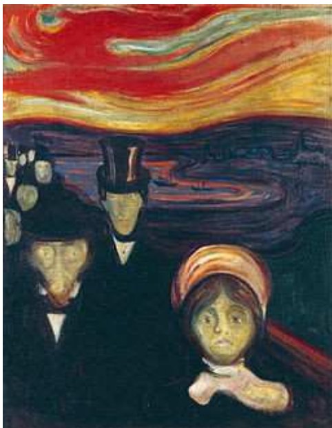
Anxiety. By Edvard Munch. 1894.

In today's fast-paced society, most people complain about being stressed. However, when they use the term stress , they rarely know its true meaning. The word carries many negative connotations and is associated with an unpleasant or traumatic event. As such, people mistakenly believe that stress is simply the nervousness and tension experienced prior to, during, or after a negative event. In fact, the effects of stress are physiological, emotional, and psychological.