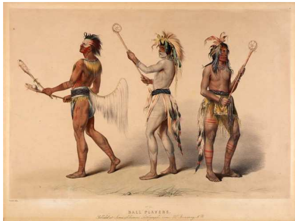
Figure 1. Ball Players. George Catlin. Date unknown.

American Indians are thought to have founded the modern game of lacrosse, as well as other stick games. Lacrosse, which received its name from French settlers, was more than a form of recreation. It was a cultural event used to settle disputes between tribes.