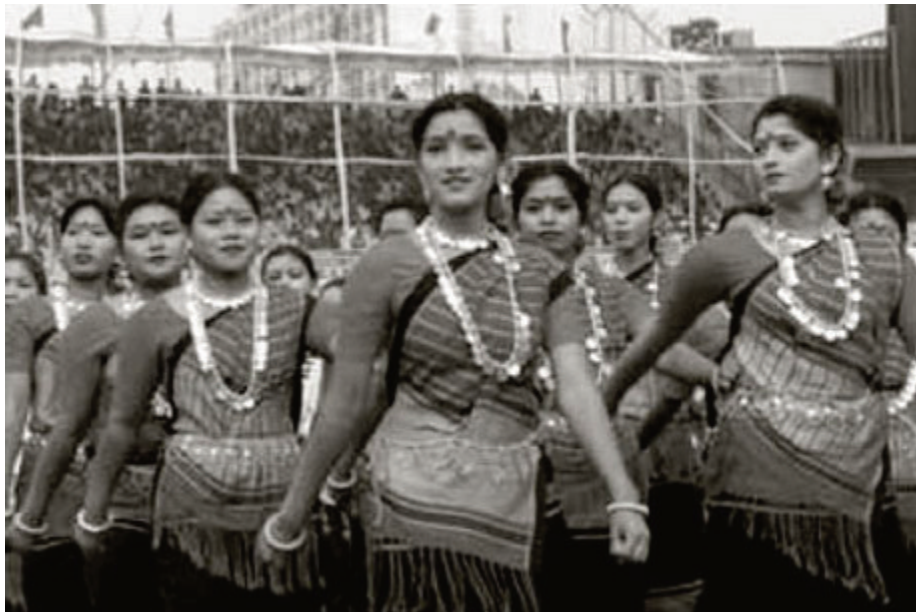
Figure 5 Celebration of a nation: Bangladeshi women parade at a ceremony celebrating the thirtieth anniversary of the declaration of independence from Pakistan, March 2001

globalisation does involve large-scale trends which add up to a significant challenge to our dominant national conceptions of political community. David Held (2000) has recommended that we adapt democracy so that new ‘constituencies’ that cross national boundaries can be recognised and their members participate in decision making on cross-border issues. He and others have also advocated global government through a world parliament and other institutions. Such views see the community as made up of those affected by certain actions or phenomena, regardless of their territorial location and loyalties. It is people affected by, for example, AIDS, acid rain and global warming, who form a new sort of ‘constituency’ and a new type of collective interest. The concern here is about people in different countries, drawn together in new forms of ‘political community’ by having a stake in the outcome of pressing cross-border issues, and the need to downgrade more rigidly national-territorial (and to some degree also legal) definitions of political community.