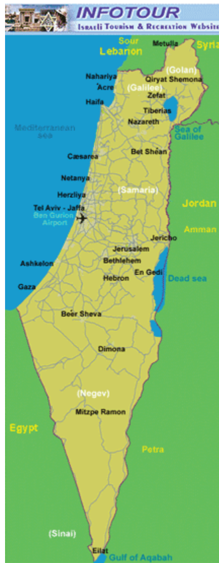
Figure 3 Visual images of a nation: website displaying map for Israeli tourism

There is a large version of the Israeli Tourism map [PDF] .