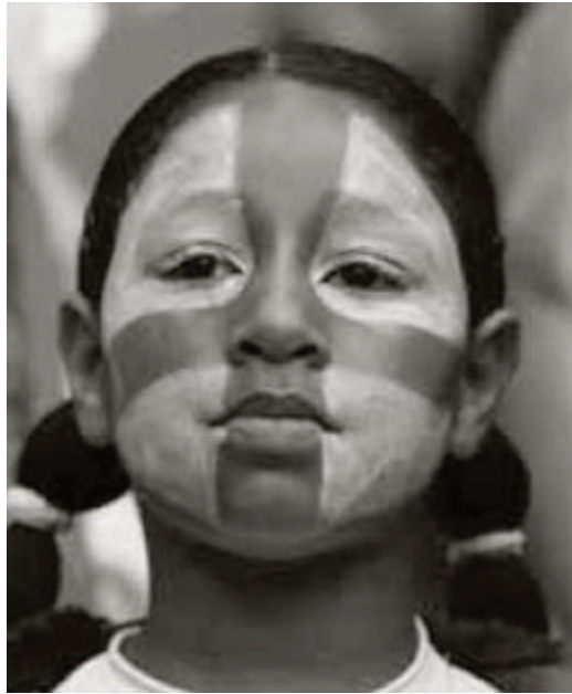
Figure 2 An expression of the English nation: a young football fan watches England v. Iceland

We can see that the problem with so-called objective approaches to defining a nation is finding sound criteria by which one might judge which groups form nations and which do not. How can we weigh different histories, traditions, religions, languages? Any attempt at objective demarcation of national communities is sure to remain contested, not least from among the groups who are thus classified.