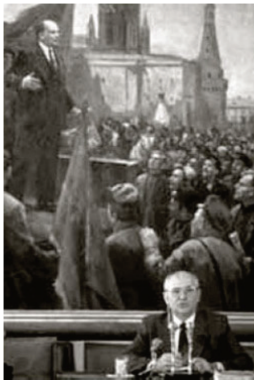
Figure 1 The end of the Soviet Union: Mikhail Gorbachev at a press conference, Moscow, July 1991