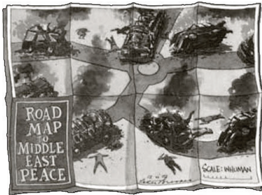
Figure 6: Road map

In this section we have explored the different dimensions of nationalism as an ideology. We now turn to ways in which political theorists have tried to deal with the issue of principles for national self-determination and secession.